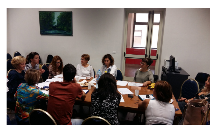
Take a look at our meeting memories!

weak spots and areas of necessary improvement. Before the closure on the thirdday, when partners discussed and developed the handbook's structure, second day also dealt with plans for the following six months and possible solutions for the final project outputs.