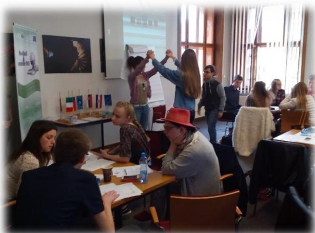
Students during the "Leaving home" activity

group one student who is different had to leave, while others had to come up with a good reason why he or she should leave the group. The aim of the activity was for students to experience the feeling of being