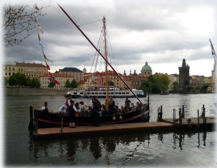
Students on the Vltava river

To make this day special, Croatian embassy in Prague organised an Adriatic day on Vltava river. Partners planned how to enjoy a beautiful day in Prague and refresh it with reading activities, so each country prepared one of the students to read aloud one song in their mother tongue language. After that, all students had an opportunity to ride the river in a traditional wooden Czech boat. Boat ride offered a beautiful view of Prague from a different perspective.