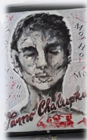
Work of Slovakian students portraying Samo Chalupka, Slovakian romantic poet

After, hosts organised an interactive Prague walk " Secrets of the old town ", a sightseeing tour of historical heart of Prague. To make the walk more interesting, while sightseeing students had a mission to take a photograph of each spot, buy or take a picture of the most bizarre souvenir that they have found during the day, take pictures of the most interesting places they have seen on the tour and mark the places they have visited in their map. This interactive walk enabled students to explore the old town having a lot of fun.