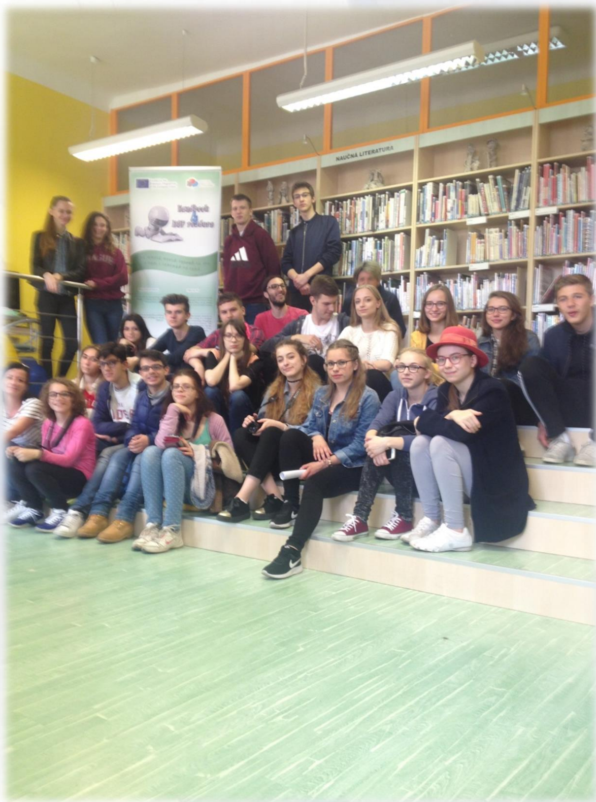
On the stairs of The Research Library

The Research Library, the second oldest and third largest library of its kind in the Czech Republic, founded in 1566. They enjoyed a presentation about its rich tradition and an extensive collection covering various interesting subjects in more than 2 million volumes.