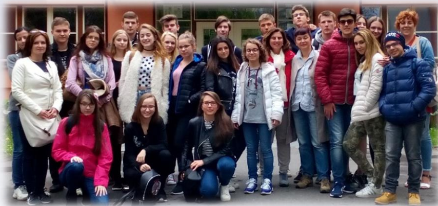
Students and mentors in front of Nahorni High School where the first workshop, Book illustration workshop, was held

First day started with a Czech workshop named „ Book illustration workshop ", during which students discussed their most significant national writers and their contributions to the national literature. Groups created posters of national writers and presented life and work of a significant national writer to other groups, offering a different perspective by telling a life story with details which they have never heard before.