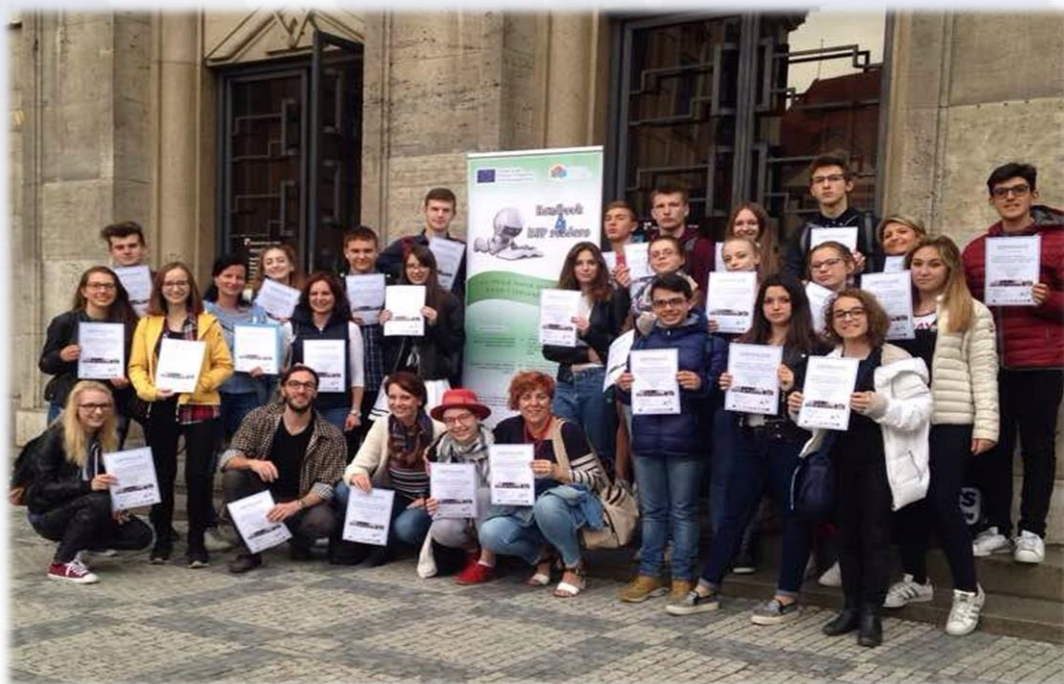
Students and teachers on the last day of the Campus

It is important to emphasize that Praha Campus encouraged students to see positive effects of reading on motivation skills, knowledge transfer, artistic expression, organizational skills and team work.