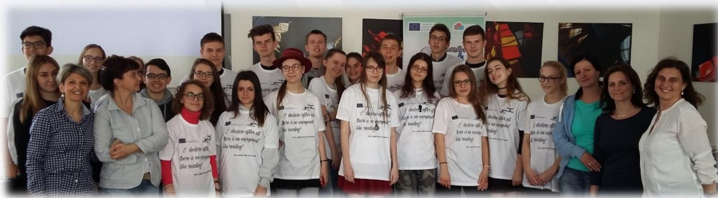
Students and mentors during Italian workshop

The leading methodology for the fifth day was those of Italian teachers, called "learning by doing". Day started with students playing a memory game in the activity Memory games: Bums on the outside, libraries inside , based on the book "Fahrenheit 451" by Ray Bradbury. In the following activity, Impossible interviews , students read two short science-fiction stories "Pattern" and "Sentry" written by Fredric Brown, created imaginary, impossible interviews with aliens and then played them in front of other groups. During the last activity So many faces in one story - Cubing , students worked on an excerpt from the book „The diaries of Adam and Eve" written by Mark Twain, using three cubes with creative activities on their sides. Students had a mission to read a paragraph, throw the dice and present the activity written on top of the cube. This game was also used in activity Reading for fun in which students participated in an entertaining competition based on questions about the text and its author. This "gamification of learning" is an educational approach to motivate students to learn using game elements in learning environments. The goal is to maximise enjoyment and engagement, capturing the interest of learners and inspiring them to continue learning.