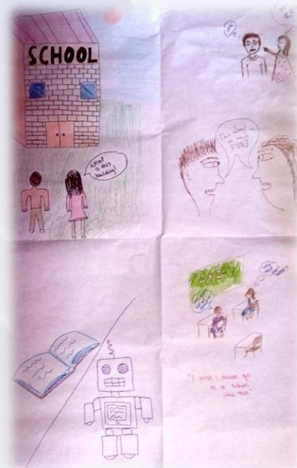
Example of the comic from the activity „The fun they had"

Third day of the meeting was a day for Slovakian literary workshops during which students became detectives! They were given a task of finding a specific book in a library, following clues hidden in various books. When they found the final book "I'll give you the sun", one of the tasks was to create an internal monologue for the main characters. Next activity was called Pantomime a story . Each group was given an excerpt of the story; they had to read it, pantomime it and record it, after which they were all trying to arrange it in the correct order to create a storyline. The third activity, named by the story by Isaac Asimov The fun they had , started with the pre-activity in which each group was on a mission to recognize as many books as they could from a collage of pictures. Student's next task was to read the story, place main characters from future to the present and illustrate it in a comic.